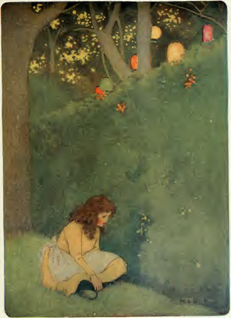
SHE HAD BEEN LOST IN EVERYTHING SHE HAD PARTLY SEEN AND HEARD